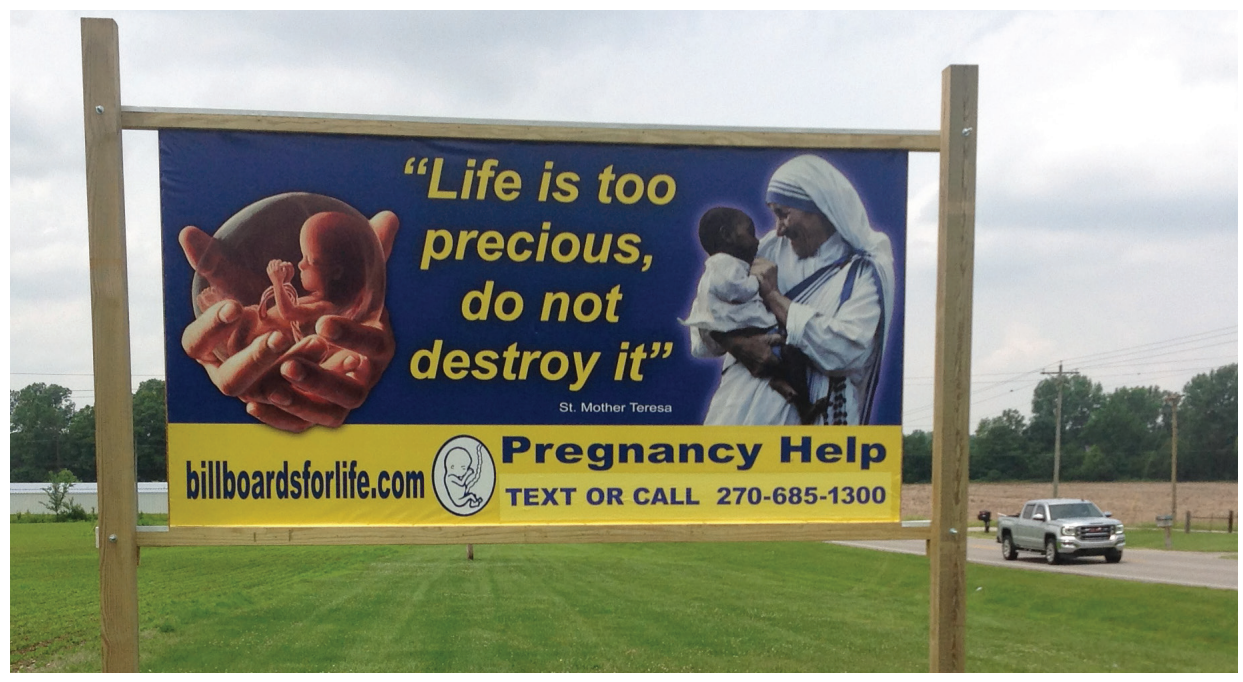
The newly-installed Billboard for Life on the property of Resurrection Cemetery in Owensboro.