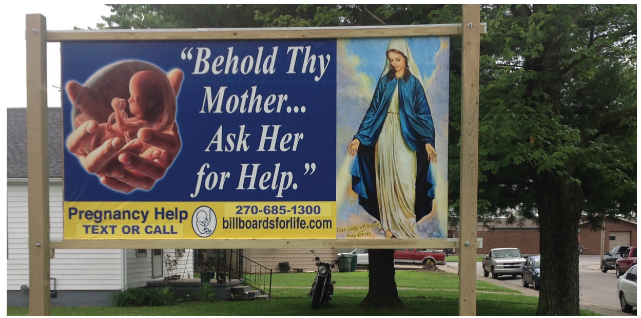
The newly-installed Billboard for Life on the property of Blessed Mother Parish in Owensboro.