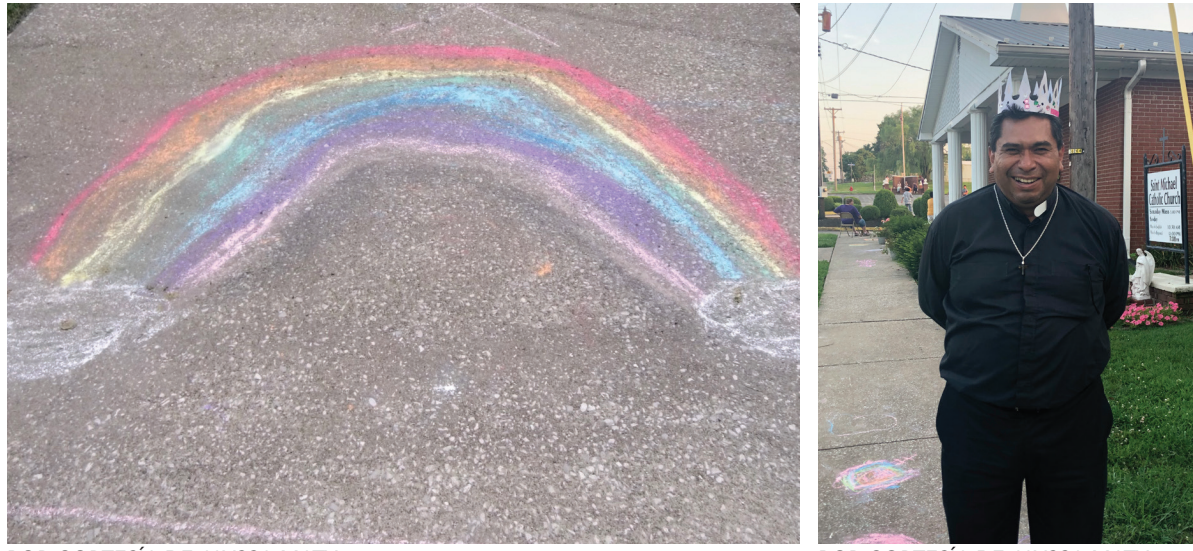
Durante los juegos, los niños divirtieron coloreando la acera. Un niña Día uno: hicimos coronas porque todos chiquilla hizo este arco iris.