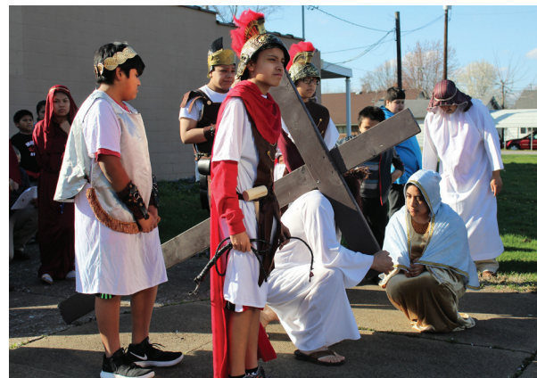
In this depiction of the fourth Station of the Cross at St. Michael Parish in Sebree, Jesus meets his mother, Mary, on the road to Calvary.