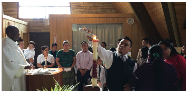
Un hombre enciende una vela de la llama del Cirio Pascual el 8 de abril.

Eugenia Wylie dice: “La Parroquia Santísima Trinidad en Morgantown fue bendecida con cinco