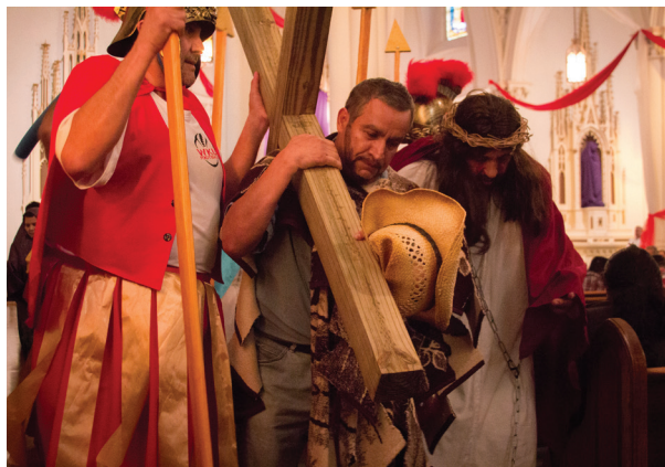
The fifth Station of the Cross is depicted as Simon of Cyrene (center) helps Jesus carry his cross, in the Via Crucis that took place at St. Joseph Parish in Bowling Green.

Via Crucis, or, the Way of the Cross, is a popular devotion in many Latino parishes on Good Friday to commemorate Jesus' Passion. Several parishes in the Diocese of Owensboro prayed this devotion this past Good Friday on March 30, 2018.