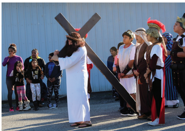
Depicting the sixth Station of the Cross at St. Michael Parish in Sebree, Veronica wipes Jesus' face and his image is left upon the cloth.