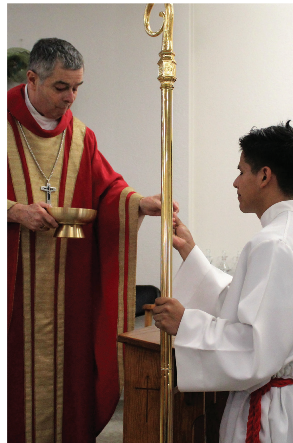
Obispo Medley da la Sagrada Comunión a un monaguillo en la Parroquia San Miguel durante la Misa de Confirmación del 17 de agosto.