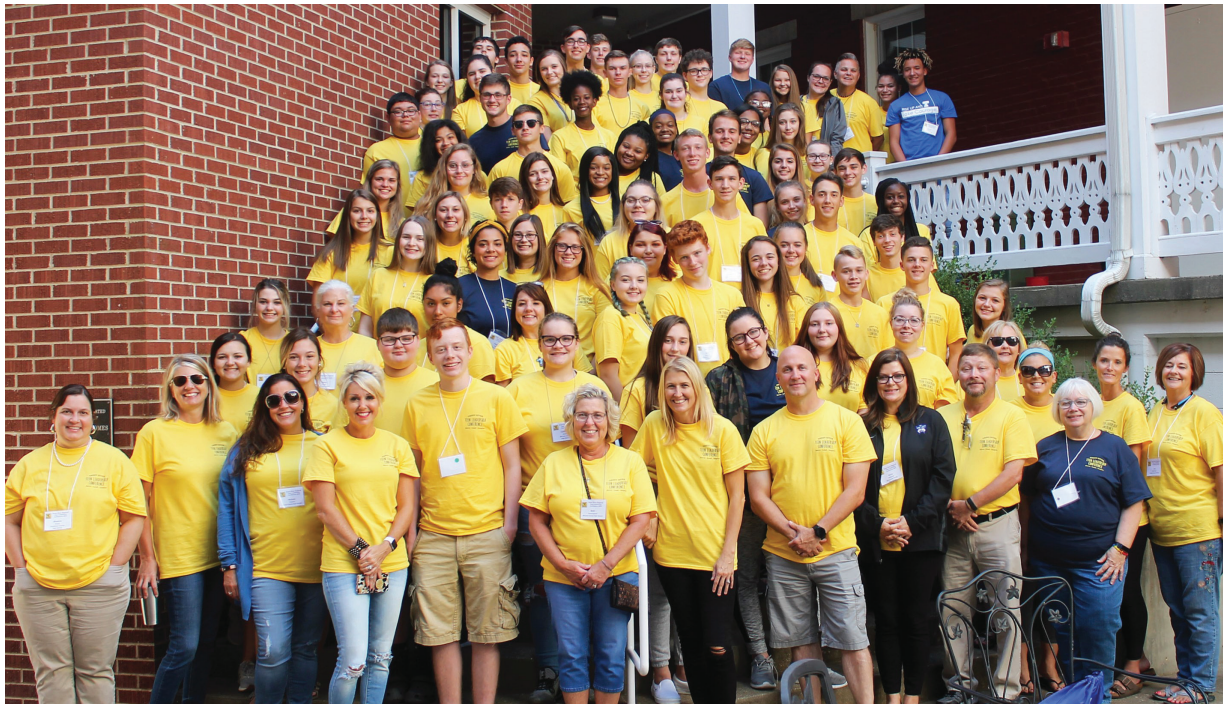
Teens attend the Oct. 2-3, 2019 Teen Leadership Conference at Mount Saint Joseph Conference and Retreat Center.