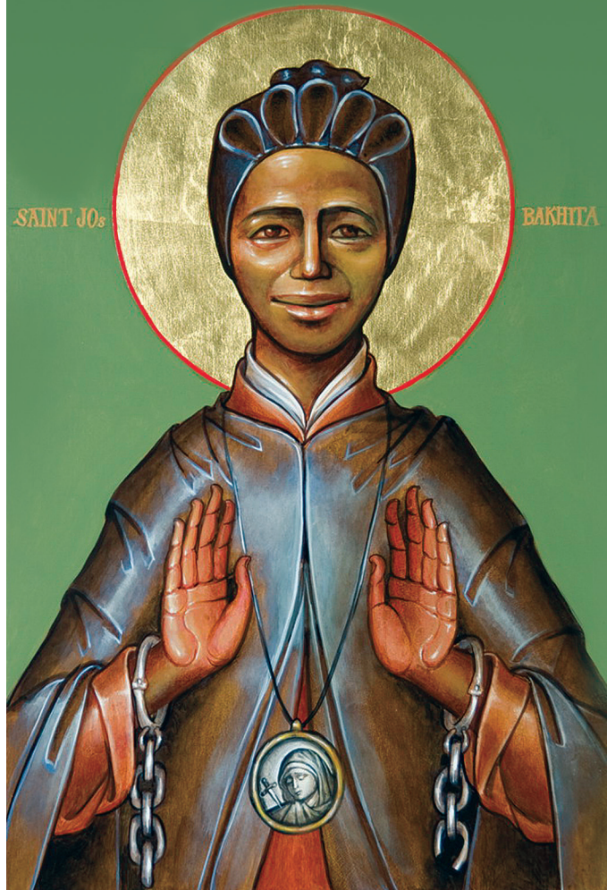
St. Josephine Bakhita