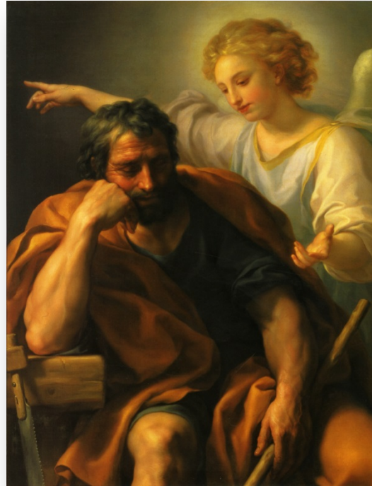
The Dream of St. Joseph Anton Raphael Mengs (1728-1779)

When Joseph awoke, he did as the angel of the Lord had commanded him and took his wife into his home. He had no relations with her until she bore a son, and he named him Jesus.