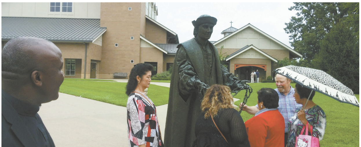
Pilgrims look at the statue of St. Thomas More at the Paducah parish.