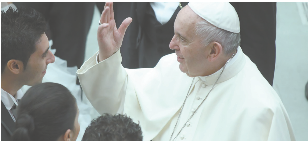
Vatican City - August 19, 2015. Pope Francis speaks with a newly married couple at the general audience in Paul VI Audience Hall on August 19, 2015.

“Love, trust and forgiveness are the three foundational decisions that Retrouvaille empowers couples to make in order to truly ‘bear wrongs patiently’ and ‘forgive all injuries,’” she said.