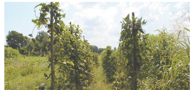
The community garden stretches for 40 plots of land, each plot either 30-by-30 feet or 30-by-60 feet.