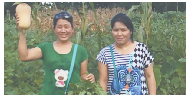
(Right) Two Burmese gardeners display some recent fruits of the harvest.