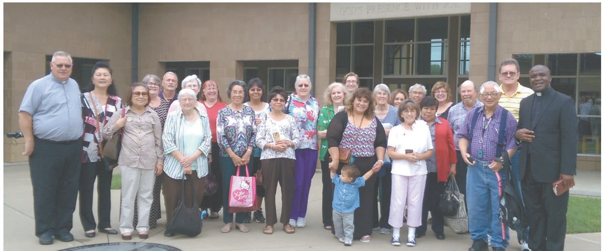
The pilgrims from St. Michael the Archangel at the Chapel of Mercy.