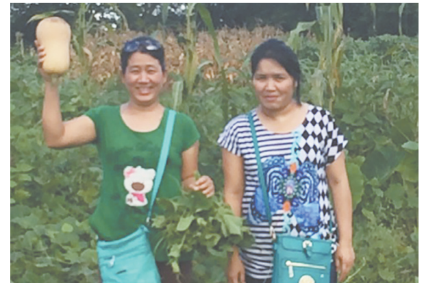
Dos jardineros birmanos exponen algunas frutas recientes de la cosecha.