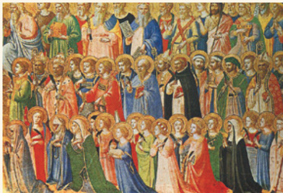
Todos los Santos, pintado por Fra Angelico.

Feliz temporada de otoño hermanos. Quizás nos queden algunas semanitas de buen sol y rico clima antes del frío, aprovechemos y disfrutemos al máximo esta bendición que nos viene de nuestro buen Padre Dios. También se acerca ya ese tiempo hermoso de fin de año con nuestras festividades llenas de colorido, tradición e historia entre ellas y para nosotros los hispanos/latinos, el -Día de Muertos y Día de Todos los Santos-. Aunque es cierto que vivimos en los Estados Unidos de América y respetamos las tradiciones del país y aprecia-