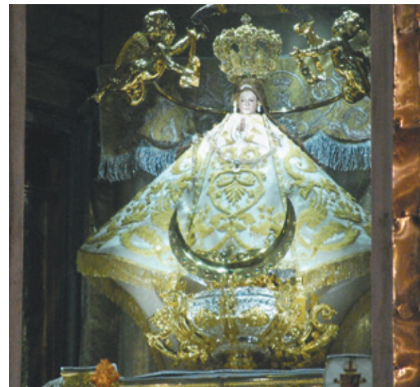
Pictured is the statue of Our Lady of San Juan in Jalisco, Mexico.

Simple peoples from Mexico to Brazil that journey on Marian pilgrimages have appointment to meet a wonderful, loving person and embrace her as their own Mother. Like St. Juan Diego that at that dramatic point during his encounters with Mary understood those words from Guadalupe: "Am I not here who am your Mother"? They are Catholics that in my experience offer clear witness that their whole life is a journey with Heav-