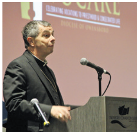
El Obispo Medley da una presentación a los 400+ invitados al segundo evento anual de VOCARE.