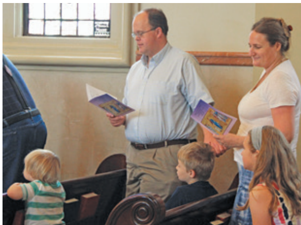
Rodeados por sus hijos, los padres se agarran de la mano mientras el Monseñor Medley los guía en la reafirmación de sus votos de matrimonio en la celebración el 20 de Sept.