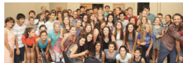
Paducah Youth Celebration at St. Thomas More Parish, Paducah.