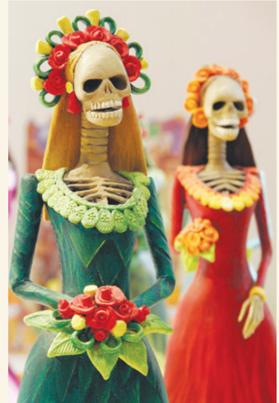
La Catrina. En la cultura popular mexicana, la Catrina, popularizada por José Guadalupe Posada consiste en el esqueleto de una mujer de la alta sociedad y constituye una de las figuras más populares en las celebraciones del Día de Muertos en México. © Tomas Castelazo, www.tomascastelazo.com / Wikimedia Commons, via Wikimedia Commons.

Que la distancia entre nuestros países de origen y donde nos encontramos ahora en los Estados Unidos no mermen el practicar nuestras tradiciones religiosas y culturales. Pidan y busquen espacio. Organicen una vigilia, recen un rosario en comunidad o júntense en alguna casa, construyan un altar de muertos, háganle a sus hijos sobre los Santos y vístanlos de algún santo, visiten algún cementerio local etc... Y sobre todo, no se olviden de educar e inculcar esto en sus hijos y nietos. Nuestras tradiciones son una