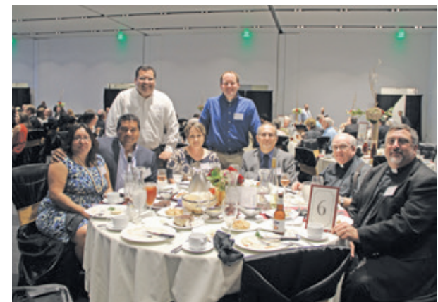
Los invitados de VOCARE de la Mesa 6 sonrían para una foto durante la cena.