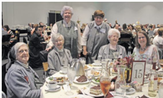
A group of Glenmary Sisters smile for a photo-op during dinner at VOCARE 2015.

raised, and as of this article's printing more than $160,000 had been raised.