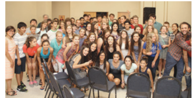
Celebración de la Juventud de Paducah en Santo Thomas More.

Ellos planean continuar construyendo puentes en su parroquia, porque han aprendido que aunque vengan de diferentes culturas, existe un lugar para cada uno de ellos en nuestra Iglesia y que la misión de Cristo es para todos. ♦