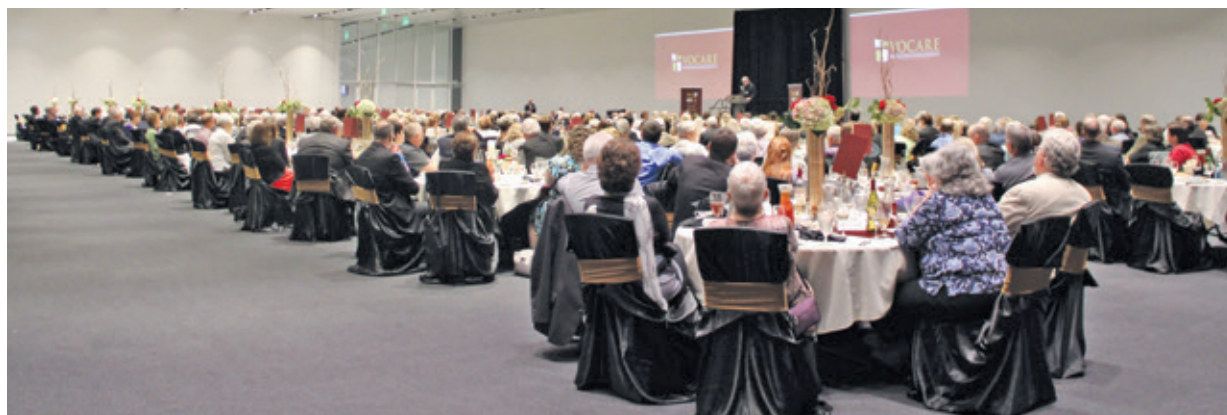
More than 400 guests attended this year's VOCARE event, a celebration of vocations to the priesthood and consecrated life in the Diocese of Owensboro.